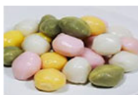
songpyeon ₩ 15,770