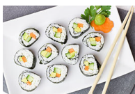
gimbap ₩ 2,360