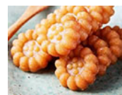
yagwa ₩ 1,230