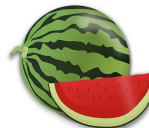
subak ₩ 1,5000